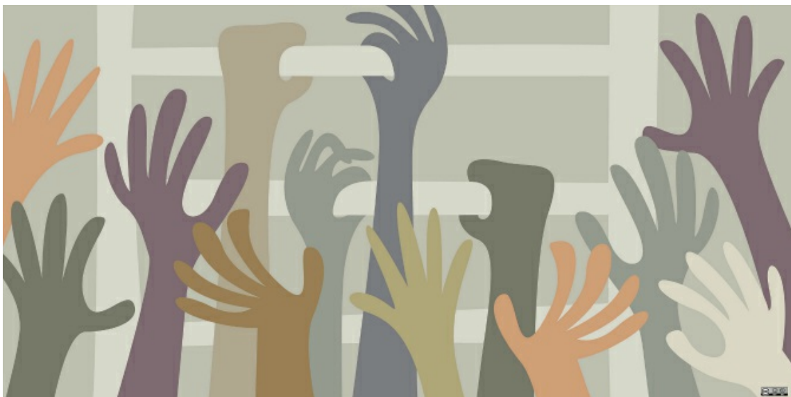
Image credit: Can hierarchy and sharing co-exist? by opensource.com. This work is licensed under a CC BY-SA 2.0 license.

There have been a number of promising developments in funding bodies' policies promoting and requesting compliance with data sharing requirements to ensure preservation and access to scientific data for further reuse. In the US, the Data Observation Network for Earth ( DataONE ), supported by the National Science Foundation (NSF), is committed to broadening education on data-related issues (e.g. data documentation, data citation), as well as to provide standards/guidelines and sustainable cyberinfrastructure to secure openness, persistence, robustness, findability, and accessibility to environmental science data.