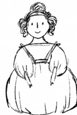
Wee Ada Lovelace – Kate Beaton

Superhero comics are the exception. While superwomen are more prominent than ever on the page, and even get to have a slight variety of body shapes and skin colours, the creator line-up at DC and Marvel – while improving – is still struggling to match the rest of the industry. One reason for this is perhaps restricted access that comics only available in a comic shop maintain – while webcomics can be found by anyone and graphic novels are prominent in book shops, only someone deliberately looking for Super Captain Ballerina #3 is going to find it. Digital distribution has gone some way to challenge that – Ms Marvel's digital sales in particular are testament to her popularity outside the regular superhero audience – figures are still ludicrously low in comparison to the number that pay to see superheroes beat up bad guys on the cinema screen or to be the Batman themselves in video games such as Arkham Asylum .