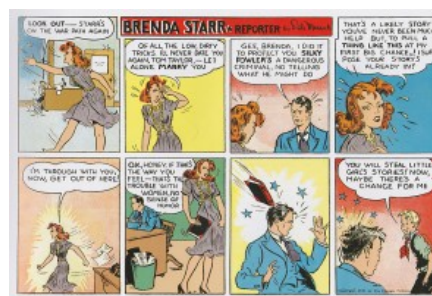
Brenda Starr – Brenda Starr, Reporter by Dale Messick, 1946

Digging into the history of Wonder Woman started me on a journey into the forgotten history of women in comics, and the many wonder women that came before Diana, both on and off the page; a forgotten history that very much ties into the tension within comics today. Before the appearance of Diana and her fabulous friend Etta Candy in the early ‘40s, there were a myriad of strong female heroes: the Phantom Lady, Sheena the Queen of the jungle, Torchy Brown, Brenda Starr, the Woman in Red, Fantomah, Miss Fury, and Red Tornado, the first female superhero, who disguised herself by wearing a cooking pot on her head (fashion!).