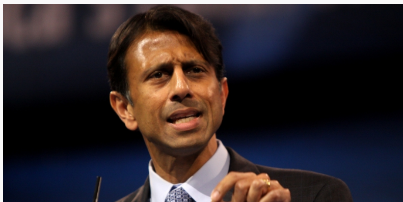
Governor Bobby Jindal of Louisiana

Yellowhammer reports that the US Department of Transportation announced this week that it would be launching an investigation into whether the closure of 31 rural Department of Motor Vehicle offices caused civil rights violations. State Democrats have argued that the closures were targeted at areas of the state with a high percentage of minority residents, who were more likely to be disenfranchised as a result.