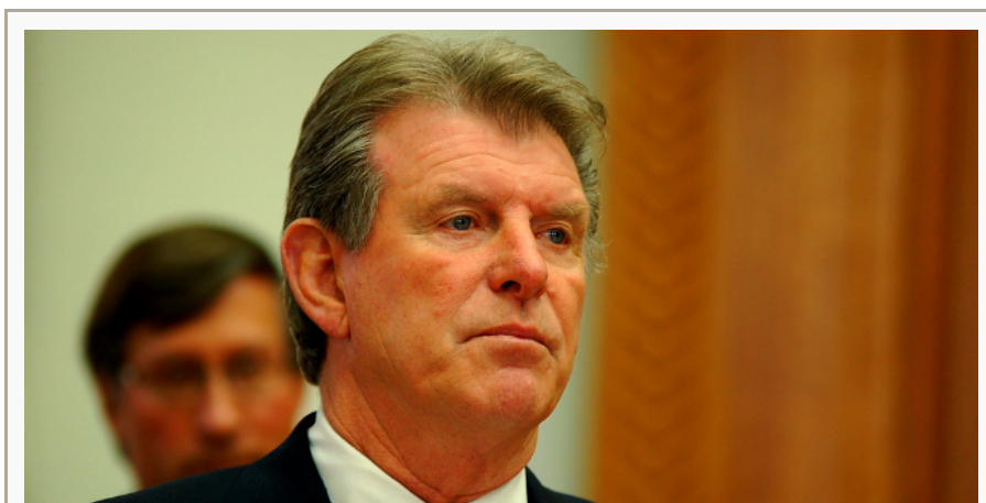
Idaho Governor Butch Otter