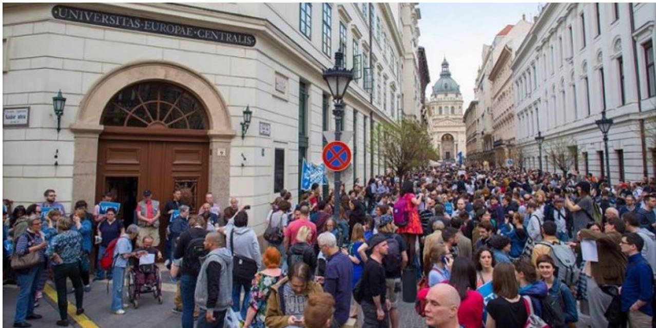
Protesters gather in front of the Central European University, April 2017.

Despite the latest developments, the current President of CEU, Michael Ignatieff, has made clear his determination to remain in Budapest, stating that: "We will never close this university and we will maintain our academic programmes no matter what. Budapest is our home". His appeal did not go unheard. The academic community worldwide has expressed its solidarity through a petition signed by more than 5=0,000 people as well as a social media campaign ( #standwithCEU ), while the US government and the European Union have emphasised the importance of civil society for democracy and economic welfare.