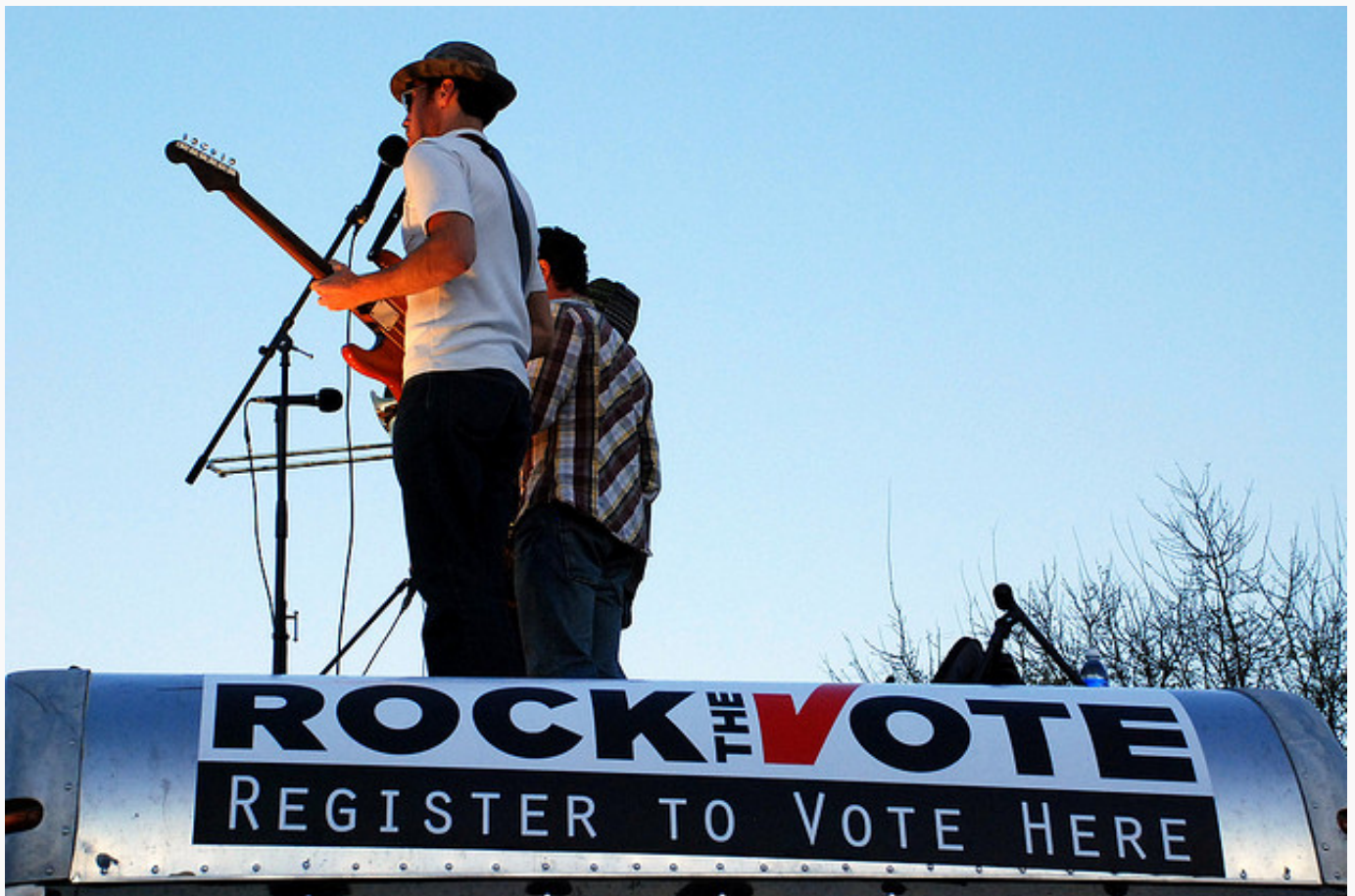
Initiatives like Rock the Vote in the US exhort people to vote.