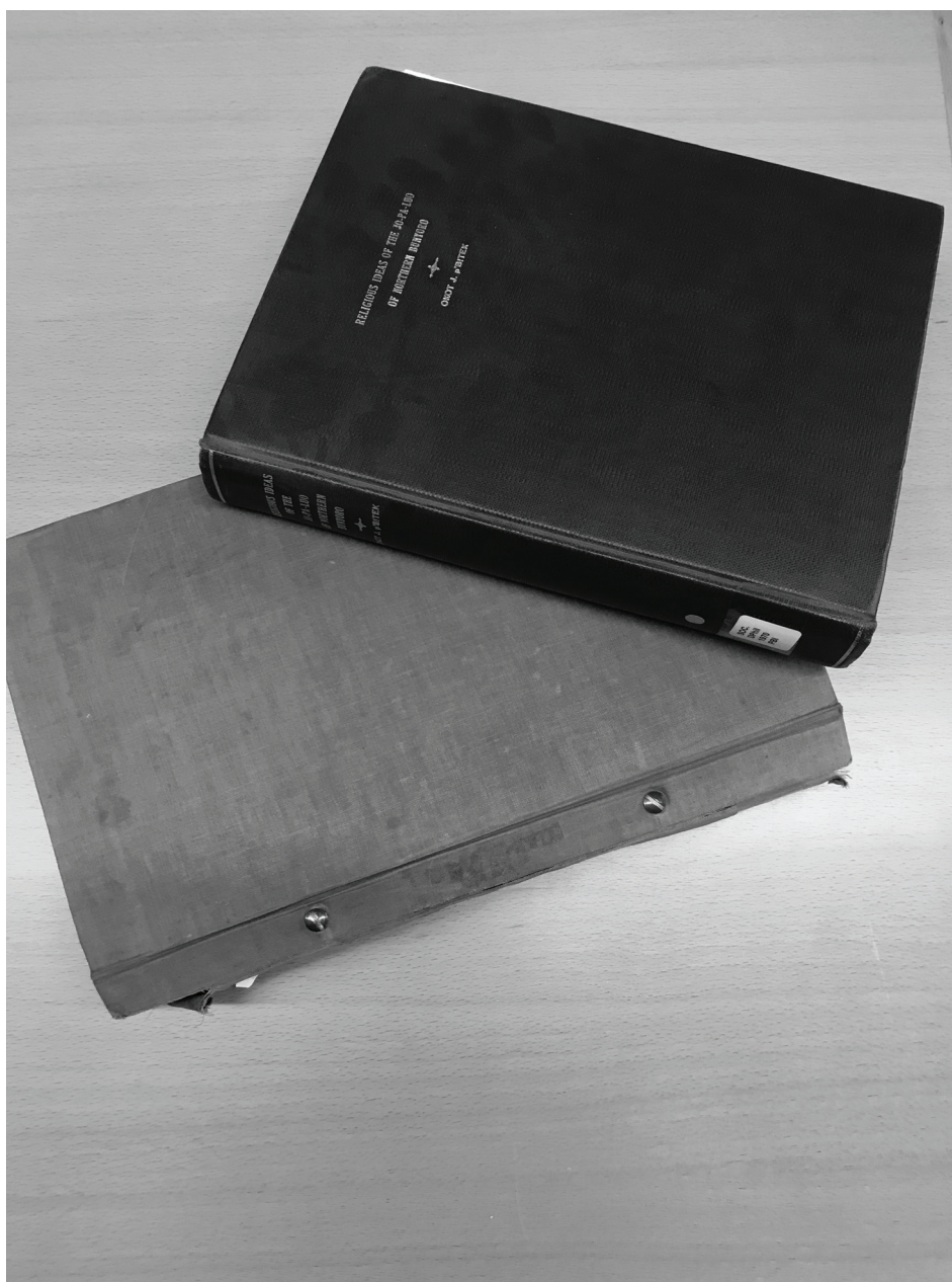
Figure 2: Okot p'Bitek and Girling's theses, photograph taken at Oxford, December 2017

joyed each other's company. They wrote in very different styles, and would have had arguments, but they had much in common – not least an antipathy for European attitudes to Africans, very mixed views about the teaching of anthropology