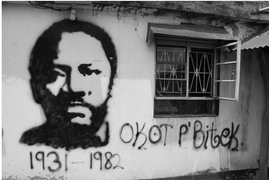
Figure 1: The painting of Okot p'Bitek by Ivan Okot on the wall of the TAKS Cultural Centre in Gulu

historical information about the societies Europeans had progressively dominated. This had generated a certain kind of universal understanding, thereby reinforcing the inequalities in capacity between the European and the non-European worlds, including between Europeanised elites and the 'traditional' masses in colonial territories. These were views that had been robustly espoused by p'Bitek for many years. By the late 1960s he was angry and defiant, even if his submitted D.Phil thesis itself is moderate in tone. Its rejection by the Oxford establishment underlines things that Asad and his colleagues were soon to highlight. It was even more of a casualty of British anthropology's colonial encounter than Girling's book, which, in the end, was published, bizarrely, by Her Majesty's Stationery Office.